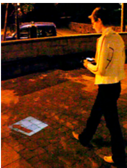
Floor projection allows the user to follow arrows rather than read a map on their phone's screen.

We propose a mobile steerable projection system utilising pico-projectors in order to dynamically reconfigure the placement of the projection area compared with the screen. Our results show how different configurations are best suited for different uses. In addition, we conducted a pilot study on potential interaction techniques.